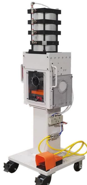
SLOT-200 MACHINE: Cuts one slot at a time is powered by shop air instead of hydraulics. This is our budget model