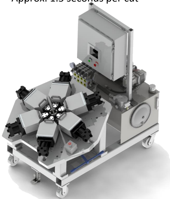
SLOT-600 MACHINE: Just like the SLOT-400 except that the SLOT-600 can do six slots at a time